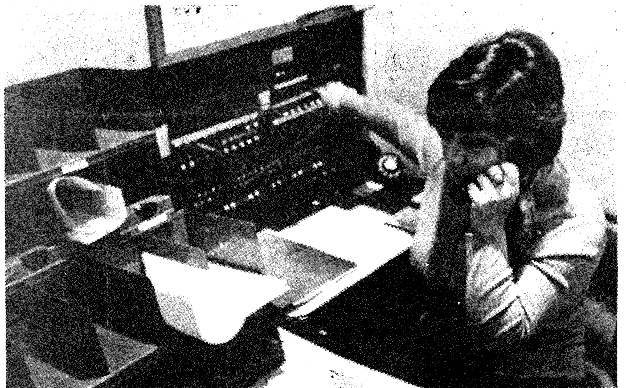
Over 7,000 Bell workers have joined the Communications Workers of Canada.

— Democratic control of the union. CWC's constitution provides for regular meetings of locals, autonomous use of funds by locals and election of rank-